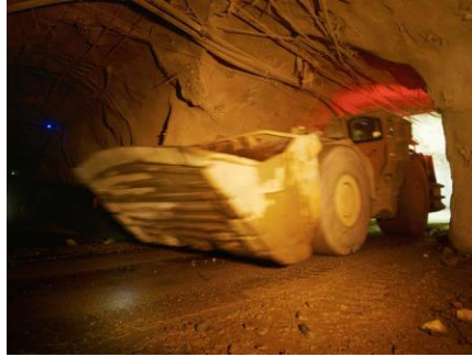
2015 - Northparkes driverless trucks head deep underground https://www.northparkes.com/news/northparkes-driverless-trucks-head-deep-underground