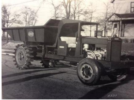
1934 - Euclid Model 1Z truck, generally considered to be the first off-highway rear dump truck for mining https://mine.nridigital.com/mine_yearbook_2018/mining_vehicles_a_ride_through_time